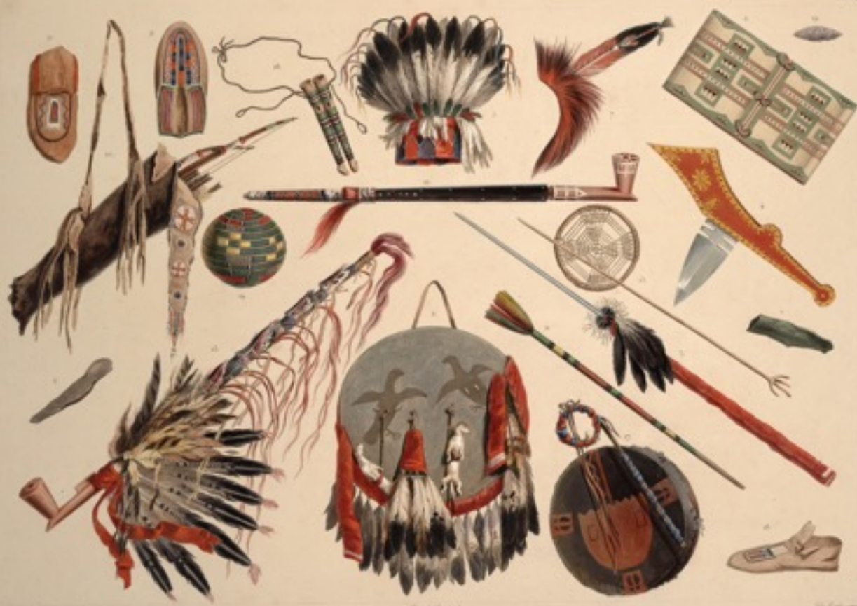
INDIANISCHE GERÄTESCHAFTEN UND WAFFEN.