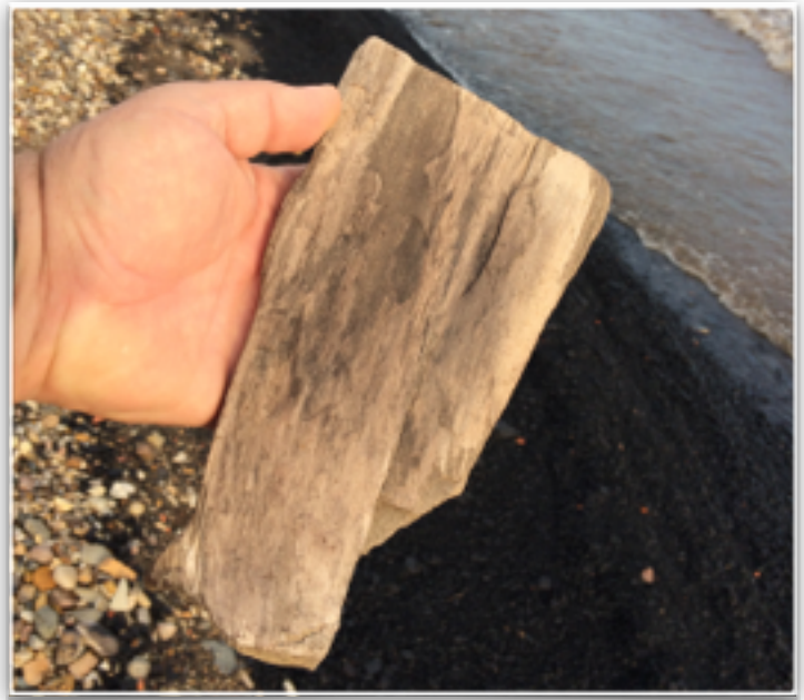
Things you find, when walking on Lake Sakakawea