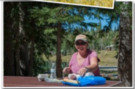
Leadville, highest city in the US